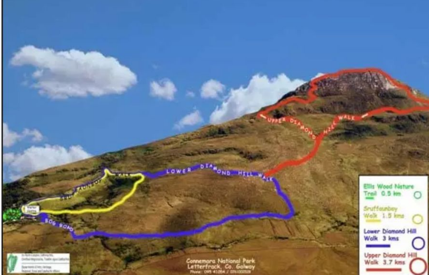
Diamond Hill Map