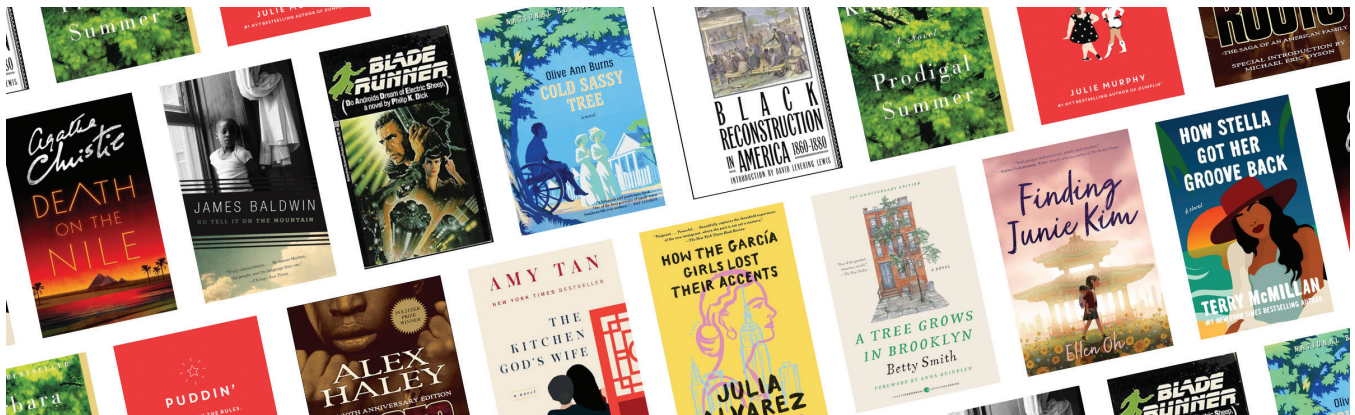
Many titles appeared in PEN America’s Index of School Book Bans for the first time during the 2023-2024 school year.

Efforts to suppress students’ freedom to read continue to affect swaths of literature. From classics novels and popular fiction to young adult stories and American history, several titles that appear in PEN America’s Index of School Book Bans for the first time during the 2023-2024 school year include: