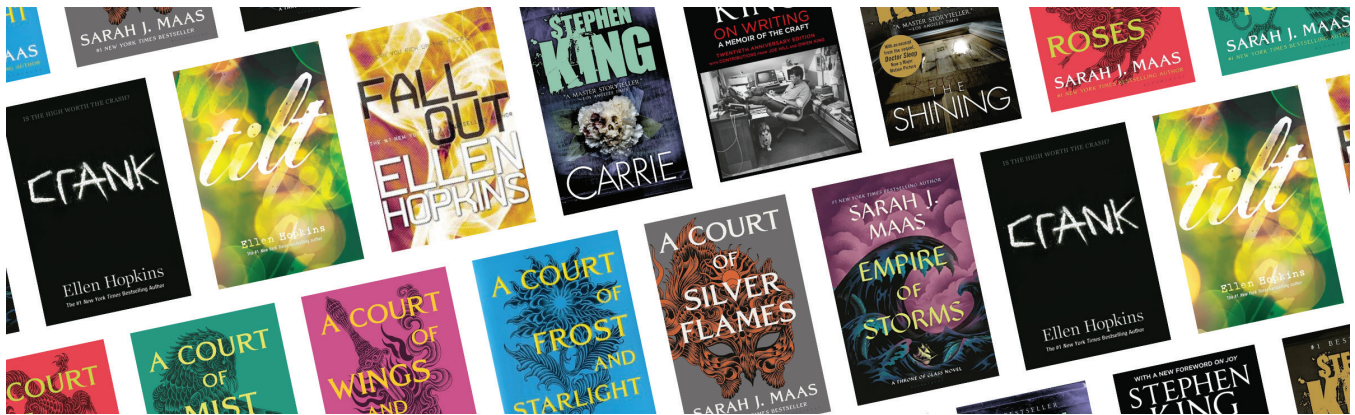
Several authors saw their back catalogs targeted after experiencing their first ban, including Sarah J. Maas, Stephen King, and Ellen Hopkins.

PEN America will release the final count for the 2023-2024 school year, an in-depth analysis of the content of banned titles, and a public Index of School Book Bans later this fall. For more information visit pen.org/book-bans .